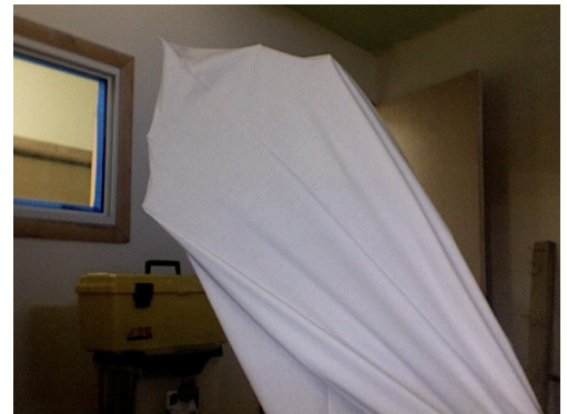
The wait is almost over for Sceptre

I am proud to announce the new look of the KoAloha Kolumn . For those of you that prefer my old Xerox copy – hand-pasted – barely typeset editions, sorry to disappoint you. My all-in-one copier went to copier heaven last month.