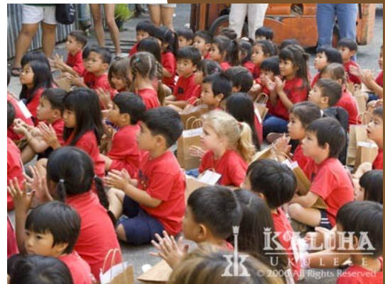
Pali Preschool students enjoyed last year's tour

I was able to witness some of the magic happening in the Ka`u music workshops held by Keoki Kahumoku . We will be working on ways to develop these types of workshops that may include building of ukulele as well.